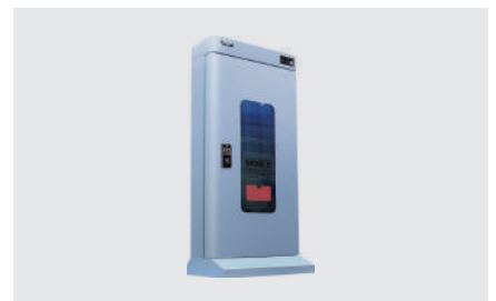
Digital microscope with HDMI/USB

*Contact us for more detailed product spec information.