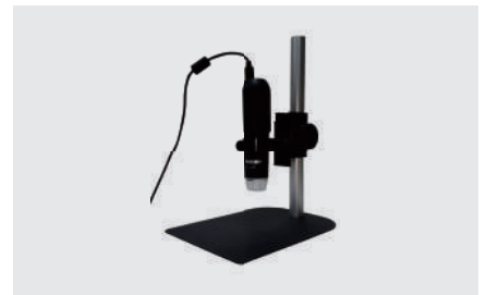
Digital microscope with HDMI/USB