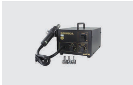
Heat blower for disassemble work