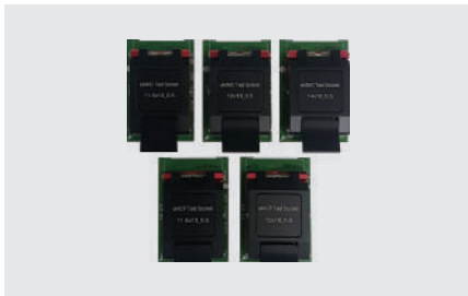
5 flash memory sockets