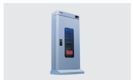
Mobile Device Safety Box

*Contact us for more detailed product spec information.