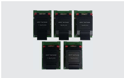
5 flash memory sockets