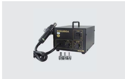
Heat blower for disassemble work