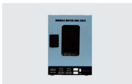
Mobile Device Dryer